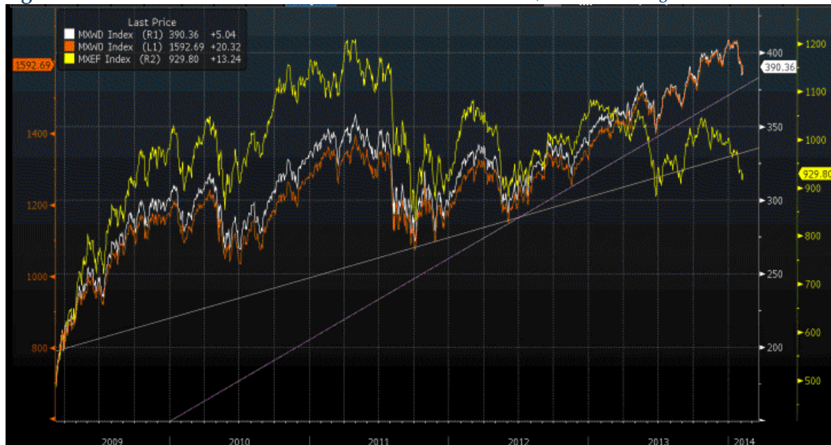
Figure 1: MXWD vs. MXWO and MXEF – 2009 to Present

This year's consensus view is that strength in the advanced economies will offset weakness in emerging markets. (In all fairness, however, it should be pointed out that this opinion was formulated before the bout of volatility that roiled global markets over the past couple of weeks). Figure 1 presents a graphical view of the relative performance of these two economic groupings since the start of this bull market in March 2009. We use the MSCI indexes as proxies, specifically the MSCI World Index (MXWO) which only includes developed markets, and the MSCI Emerging Markets Index (MXEF). These two indices together constitute the MSCI All-Country World Index (MXWD). As can be seen, the MXWD and MXWO move in sync – which is to be expected, given that the latter constitutes 83.3% of the MXWD – and still have some way to go before testing trend-line support (about 4% and 15% lower, to be precise). But it's a different story with the MXEF, which seems to be headed lower. The point is – emerging markets collectively make up only 16.7% of global equities, and as long as developed markets can grind their way higher, this five-year old bull run may have more longevity.